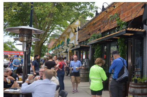
4517 N Oakland Ave